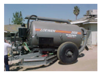
Loewen honey vac

To address this manure management crisis, the Milk Producers Council teamed up with Inland Empire Utilities Agency, a municipal sewage company located in Chino, and developed a system for collecting manure from local dairies and digesting the manure anaerobically, in a centralized digester. It is a win-win situation for the dairies and the utility company.