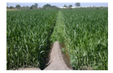
Land application through irrigation

The control of nutrient application rates using this approach has allowed producers to reduce and in some cases eliminate commercial fertilizer purchases without sacrificing yields.